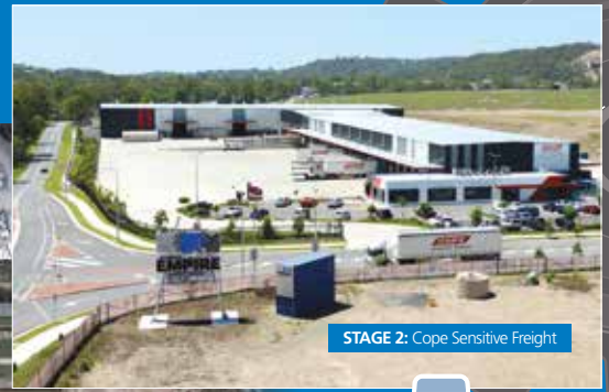
STAGE 2: Cope Sensitive Freight