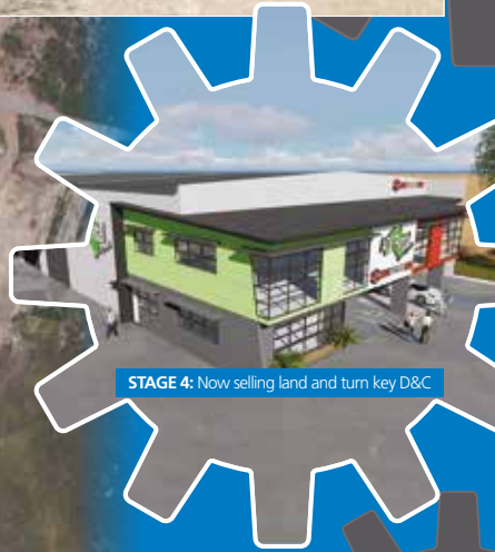
STAGE 4: Now selling land and turn key D&C